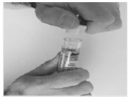
Pull off the yellow cap