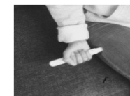
Firmly massage the injection site afterwards