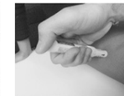
Hold it in position for 10 s, remove it and gently massage the injected site