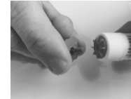
Remove the black safety cap from red firing button