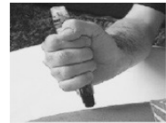
Place to back, tip against outer thigh