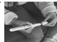
Remove the needle shield