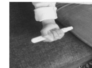
Place and press the auto-injector against the outer side of the thigh. You will hear a click when the injection has started. Hold it against the thigh for 5 seconds.