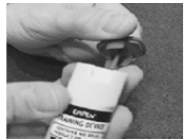
Pull off blue safety cap