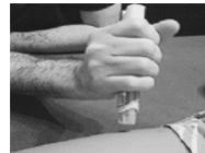
Swing and push orange tip against outer thigh (with or without clothing)