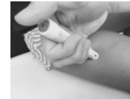
Hold the auto-injector against the outer thigh and press the red button