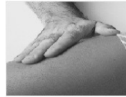
Massage the injection site for 10 s