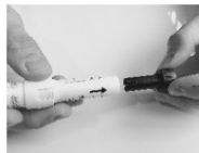
Remove the black needle cap