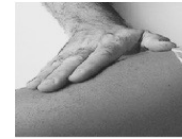
Massage the injection site for 10 s